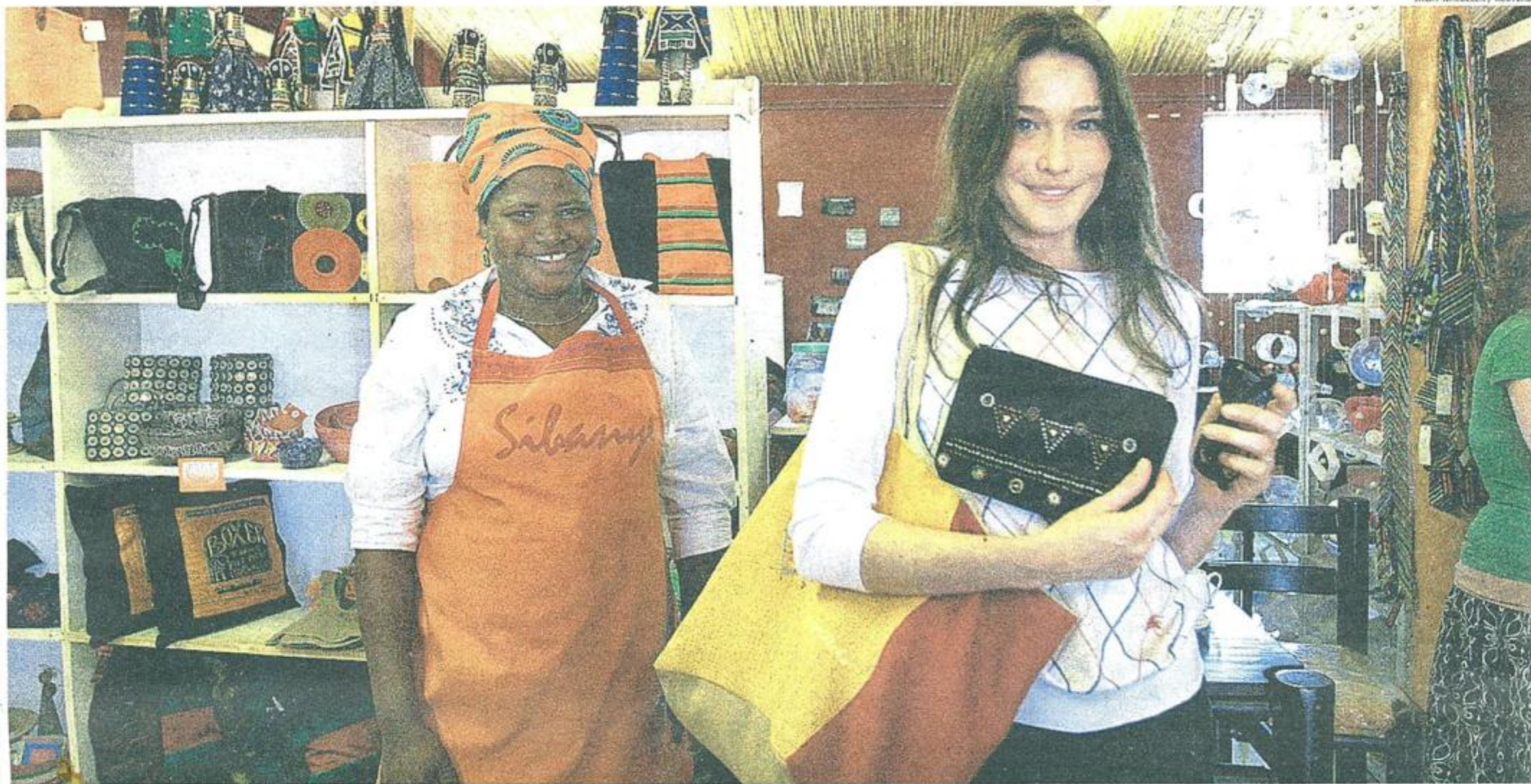
The Sophumelela co-operative's brightly coloured bag, nicknamed the Carla, is helping its women makers to earn a good wage in an area dominated by violence