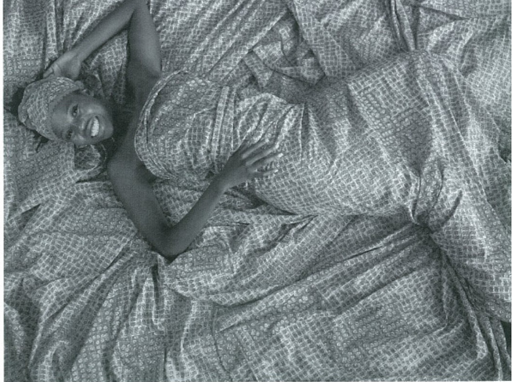
▲ Fabric textures are inspired by the fascinating colours and patterns of the townships.