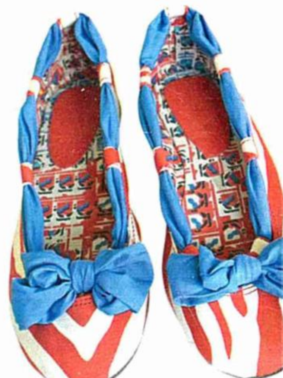
Shoes by Township Patterns R550