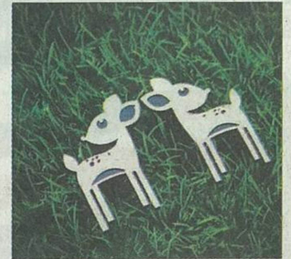
BAMBIS: ‘Oh dear’ brooch by Trinket Brooches.

For more info on where to get yours, visit www.trinketdesign.co.za