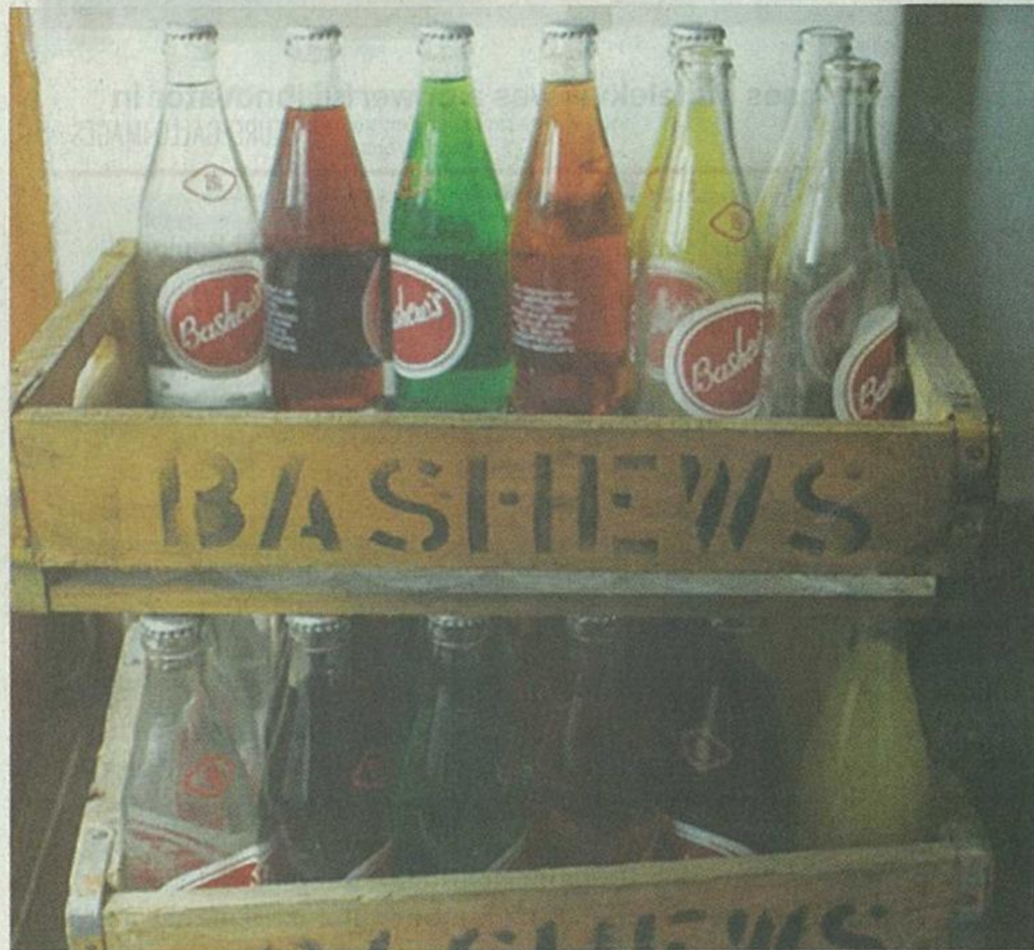
VERY DIFFERENT: Ed Suter Fizz Pop coasters.

If you must have, then visit www.edsuter.com to track them down.